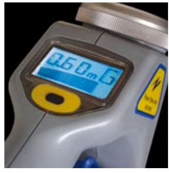
In the G mode the C.A.T<sup>3</sup> detects a tone radiated by the Genny+ to a buried conductor.